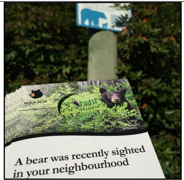
District of West Vancouver

A total of 2272 residences were canvassed in 2018. These addresses received door hangers (shown in pictures), and some areas received letters and/or Green Cards (DNV only) also: