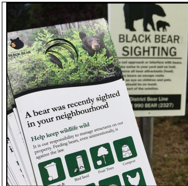
District of North Vancouver

When the Society learns of bear activity, there is a coordinated approach to education with signs and door-to-door canvassing or email distribution to Block Watch areas at the request of the Captains.