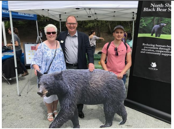
Blueridge Good Neighbour Day

The North Shore Black Bear Society had displays at all major community events on the North Shore. We had interactive displays at 17 events where we talked with over 3000 people .